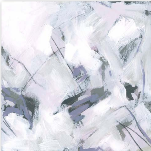
2856420 Cloud Calculus III June Erica Vess | 18x18