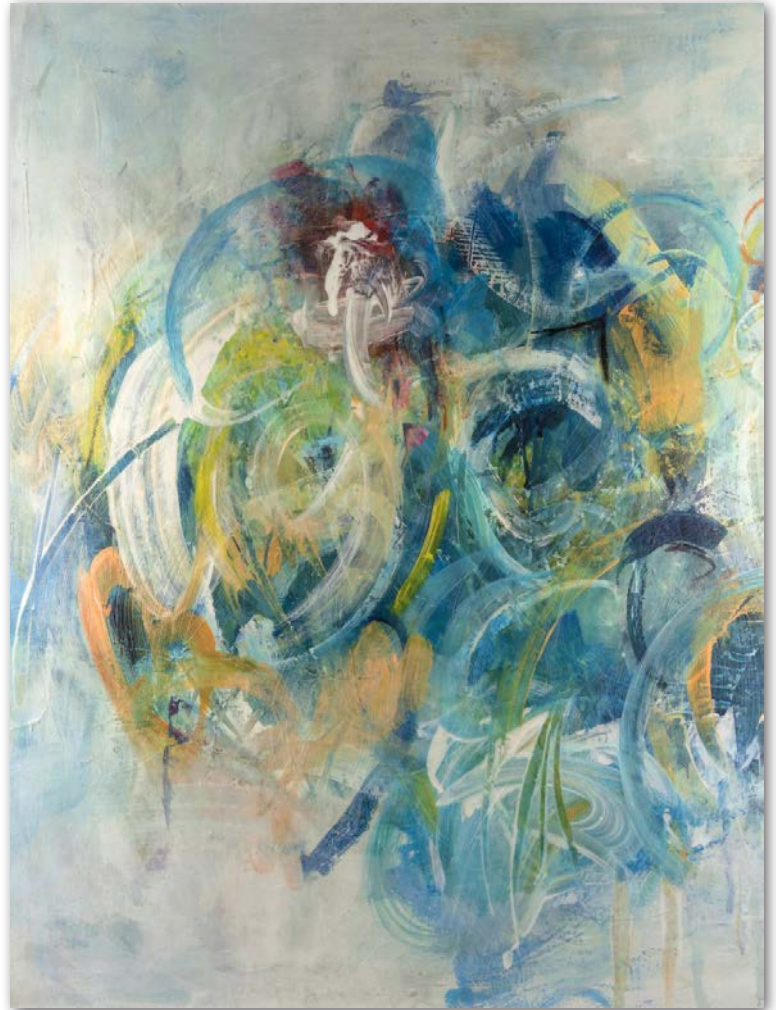
2849513 Silent Energy II Retail $275 | Joyce Combs | 40x30