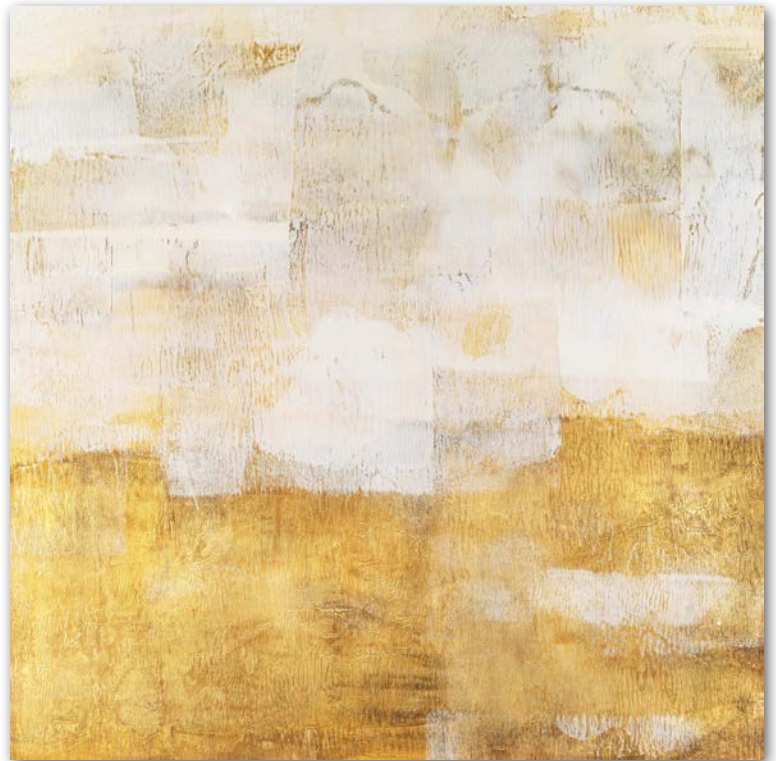
2849530 Golden Grains II