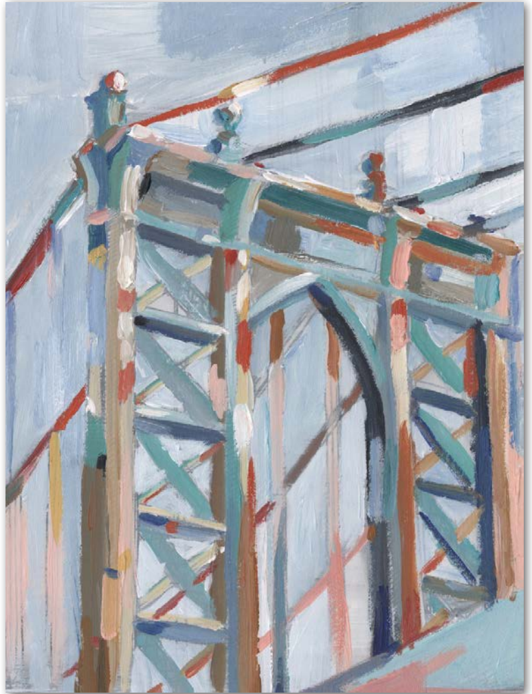
2870061 Big City Colors II Ethan Harper | 32x24

Available on Fine Art Cotton Rag Paper in Limited Editions of 950 with Artist Signature