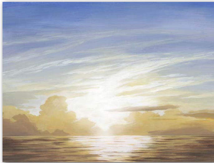
2869920 Luminous Waters III Grace Popp | 24x32

Available on Fine Art Cotton Rag Paper in Limited Editions of 950 with Artist Signature