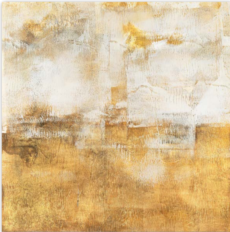
2849529 Golden Grains I