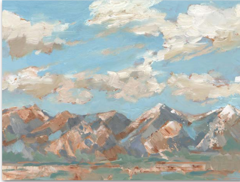
2870193 Pastel Western Vista I