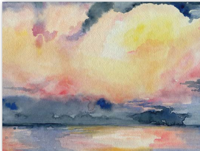
2869962 Prism Seascape III Jennifer Paxton Parker | 18x24

Available on Fine Art Cotton Rag Paper in Limited Editions of 950 with Artist Signature