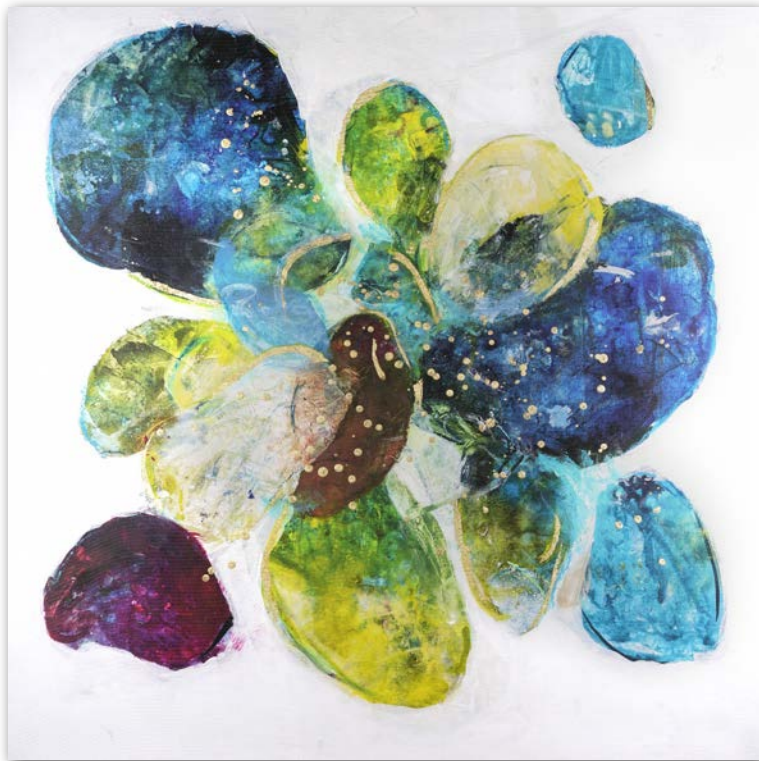
2849494 Interpretations I Retail $175 | Joyce Combs | 36x36