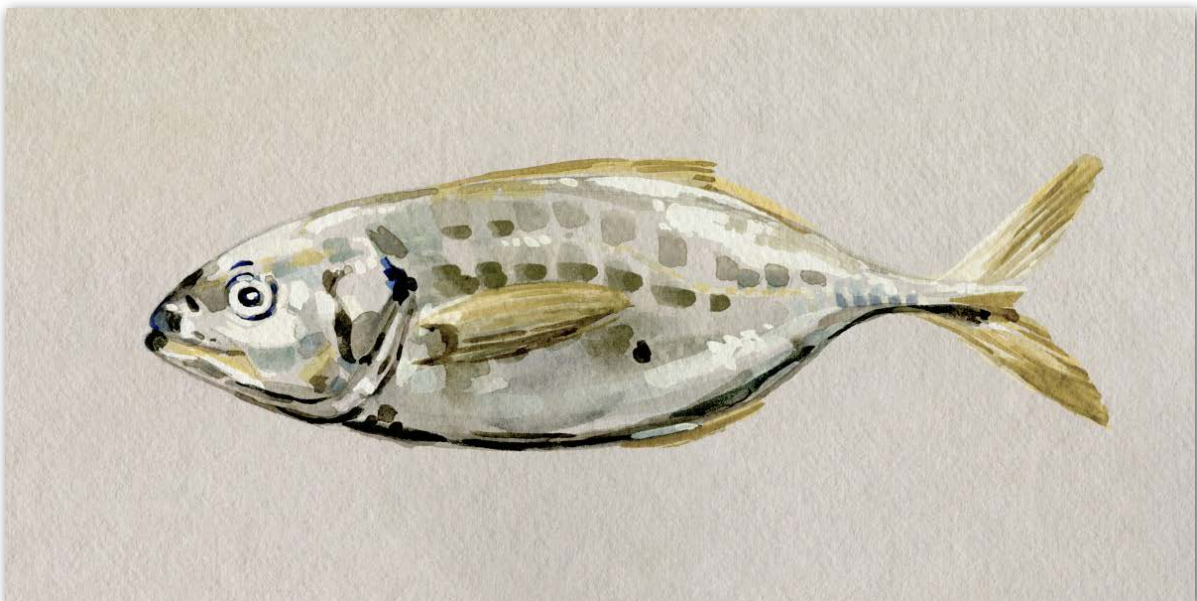
2870132 Fresh Fish Study II