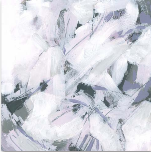
2856418 Cloud Calculus I June Erica Vess | 18x18