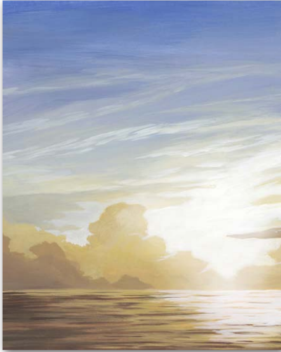
2869918 Luminous Waters I Grace Popp | 20x16