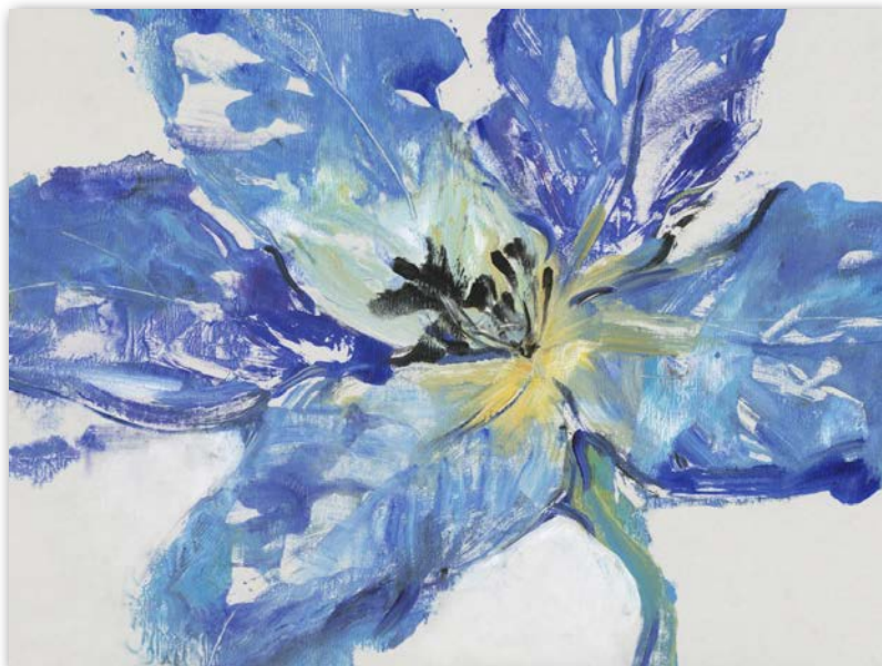
2869890 Fleur Bleue II