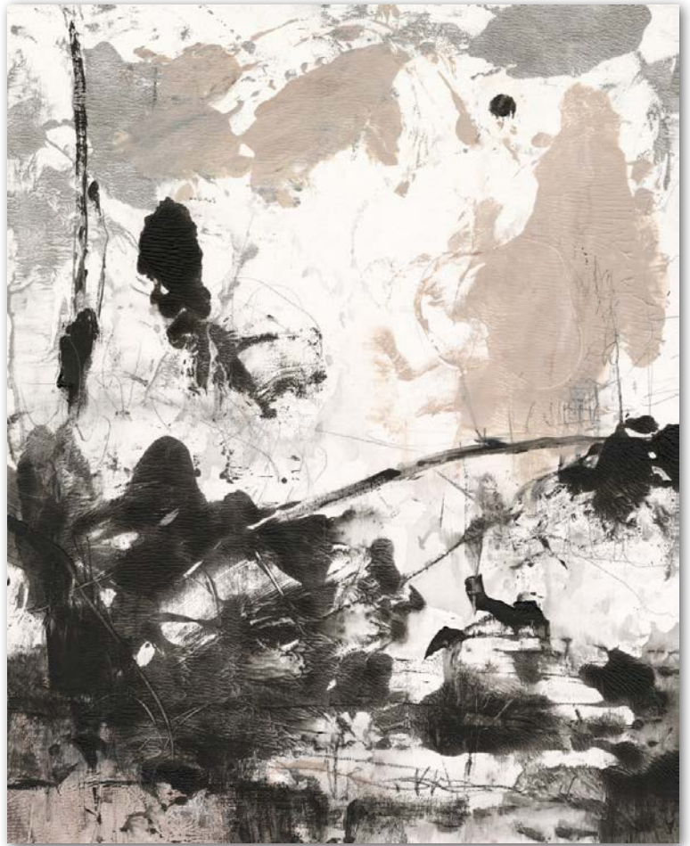
2869875 Disarray II Tim O'Toole | 30x24

Available on Fine Art Cotton Rag Paper in Limited Editions of 950 with Artist Signature