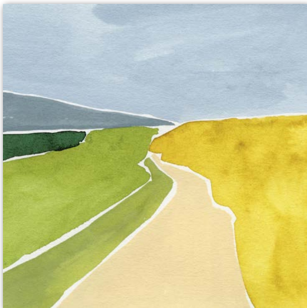
2870119 Distant Path III Victoria Barnes | 18x18