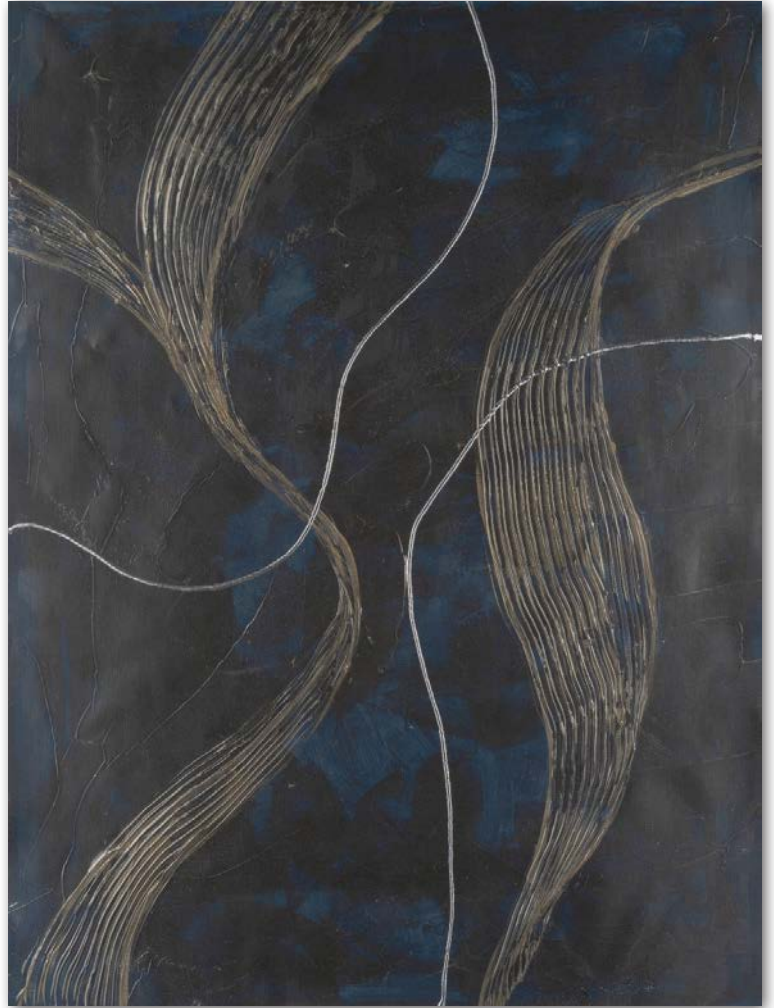
2861248 Laminar Flow II