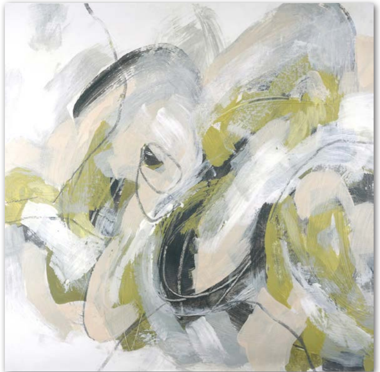
2849548 Rolling Sprint II