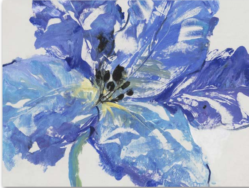
2869889 Fleur Bleue I