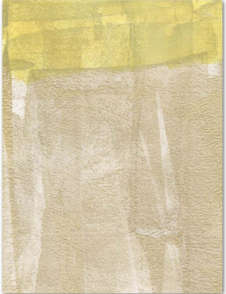
2869755 Vovere II Sue Jachimiec | 24x18

Available on Fine Art Cotton Rag Paper in Limited Editions of 950 with Artist Signature