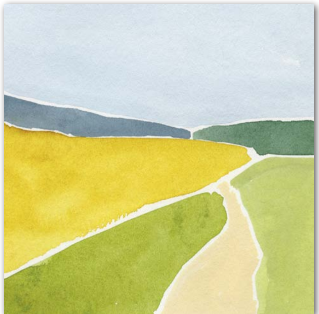
2870120 Distant Path IV Victoria Barnes | 18x18

Available on Fine Art Cotton Rag Paper in Limited Editions of 950 with Artist Signature