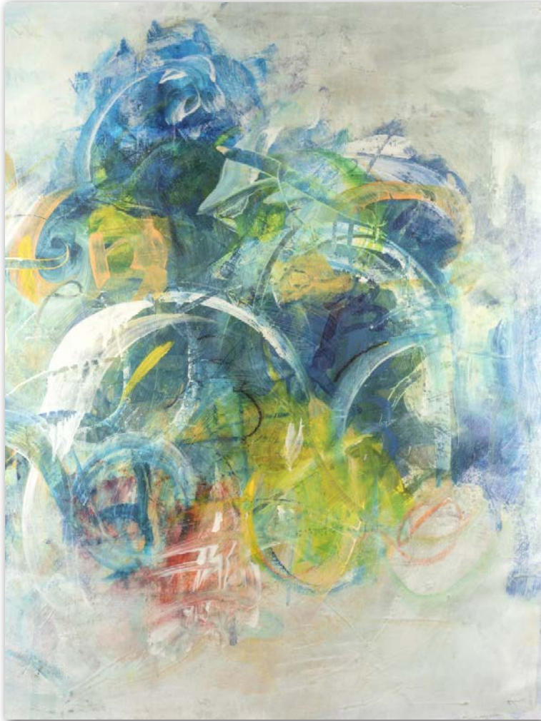
2849512 Silent Energy I Retail $275 | Joyce Combs | 40x30