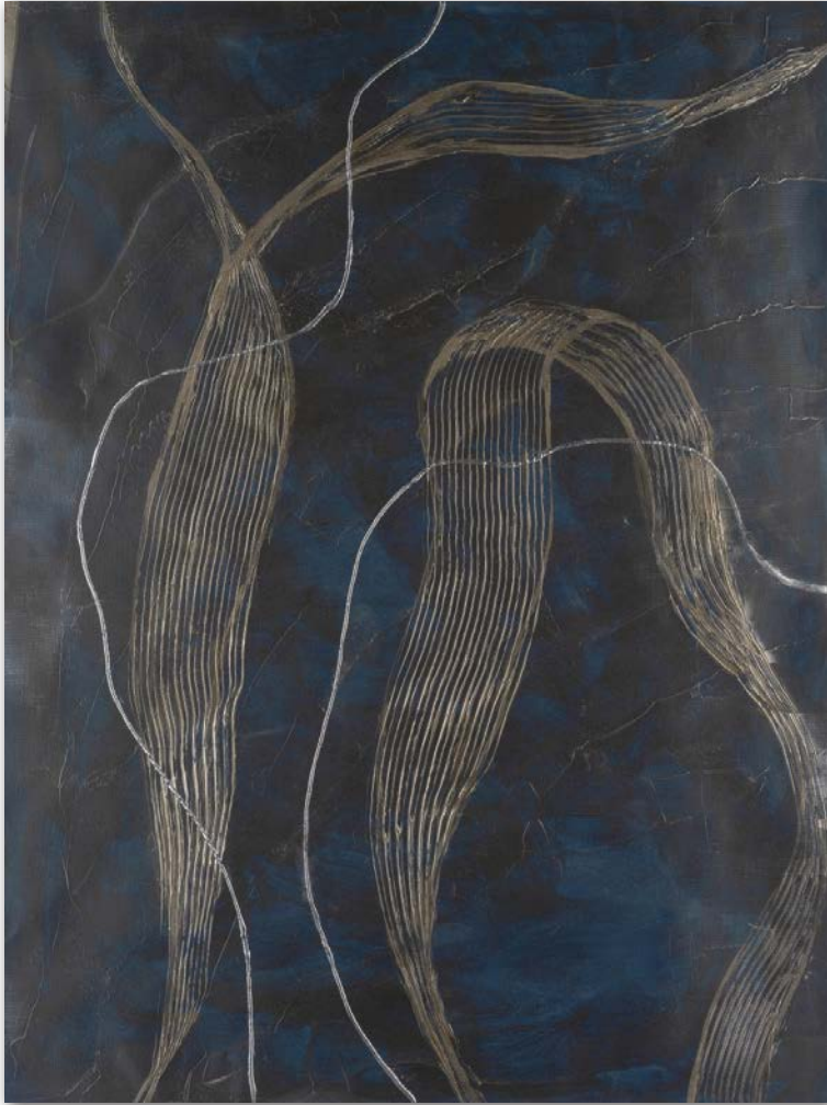
2861247 Laminar Flow I