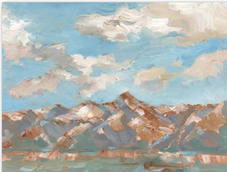
2870194 Pastel Western Vista II