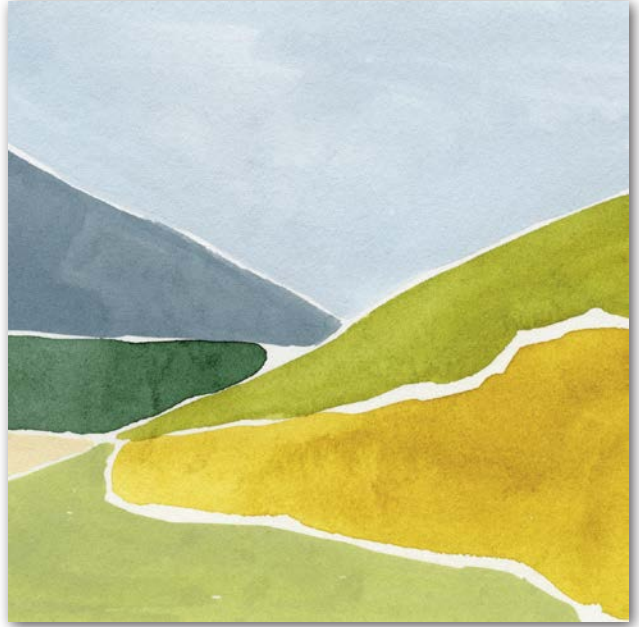
2870118 Distant Path II Victoria Barnes | 18x18