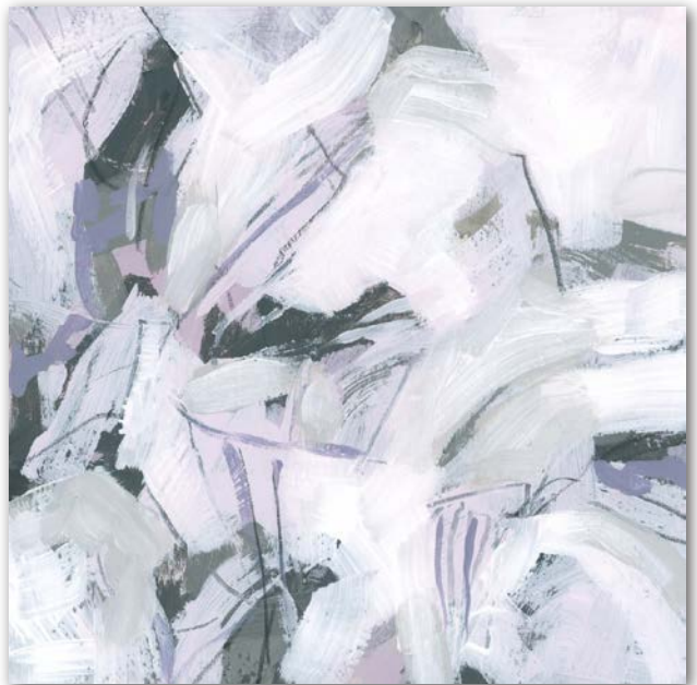
2856421 Cloud Calculus IV June Erica Vess | 18x18

Available on Fine Art Cotton Rag Paper in Limited Editions of 950 with Artist Signature