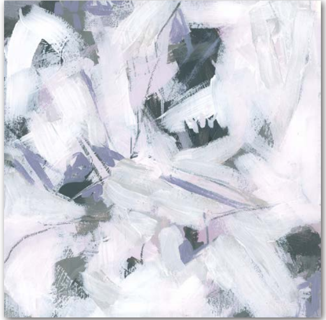
2856419 Cloud Calculus II June Erica Vess | 18x18