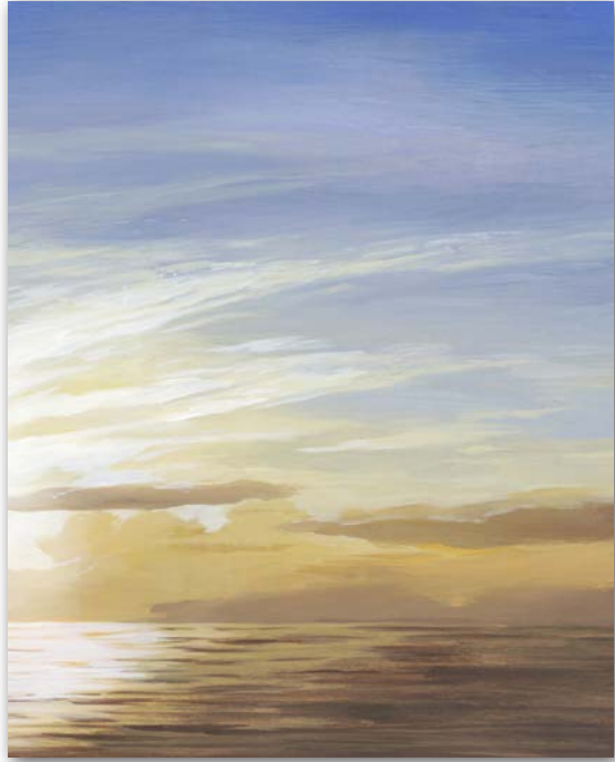
2869919 Luminous Waters II Grace Popp | 20x16