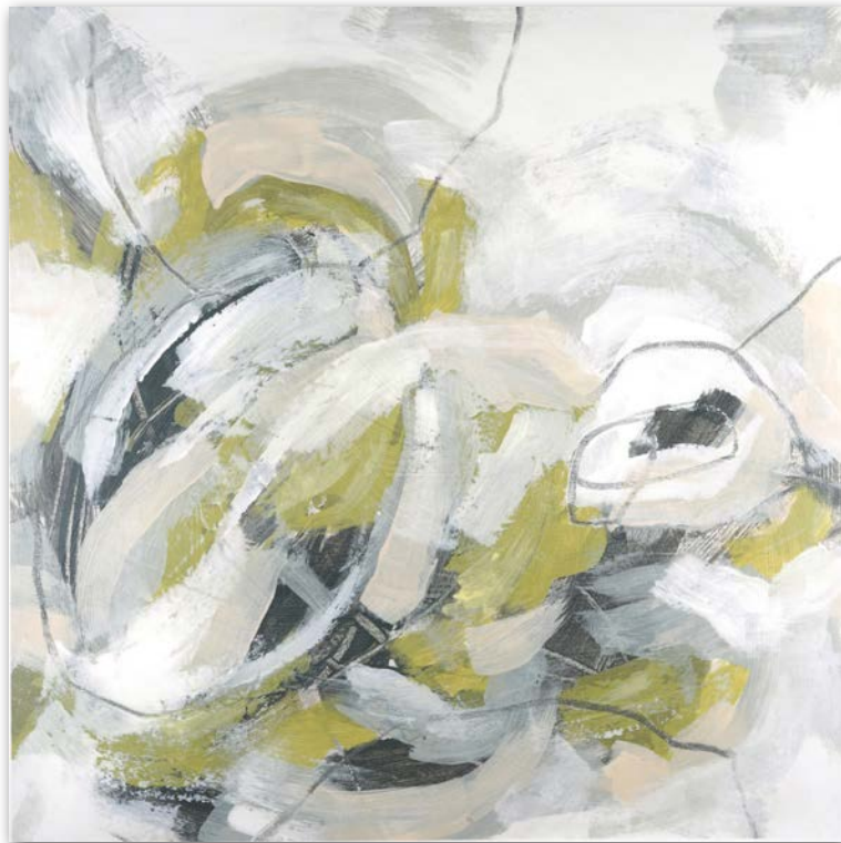
2849547 Rolling Sprint I