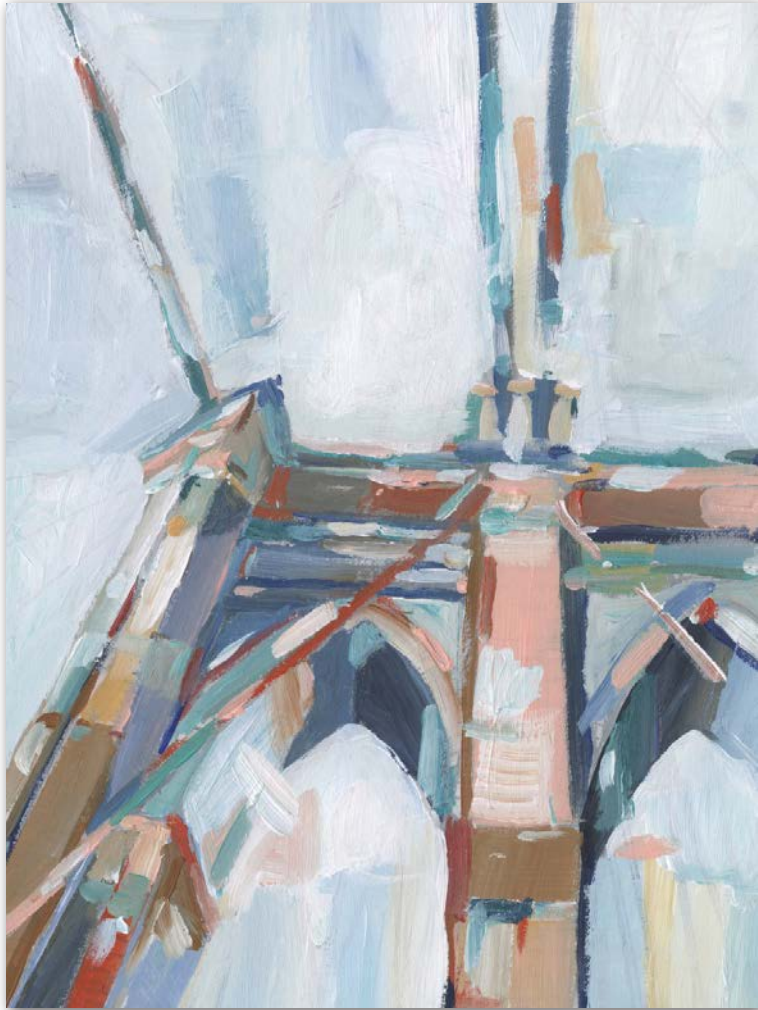
2870060 Big City Colors I Ethan Harper | 32x24