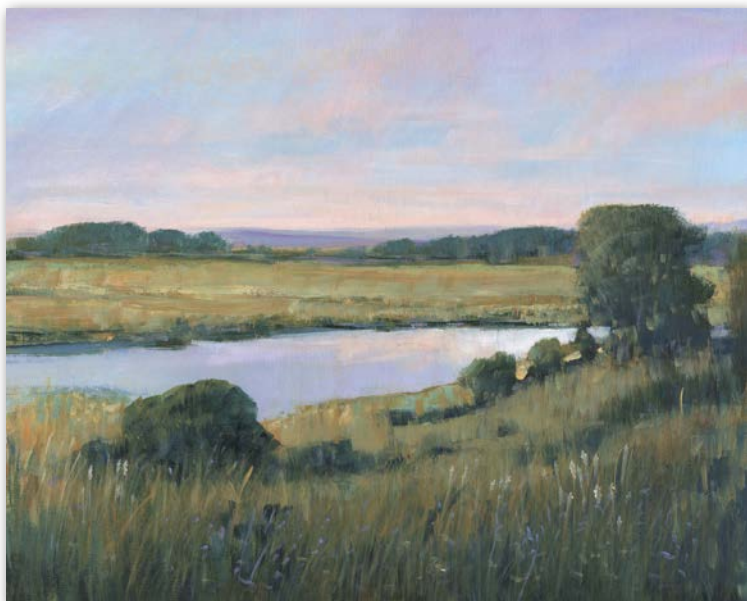
2869983 Spring Marsh II Tim O'Toole | 24x30

Available on Fine Art Cotton Rag Paper in Limited Editions of 950 with Artist Signature