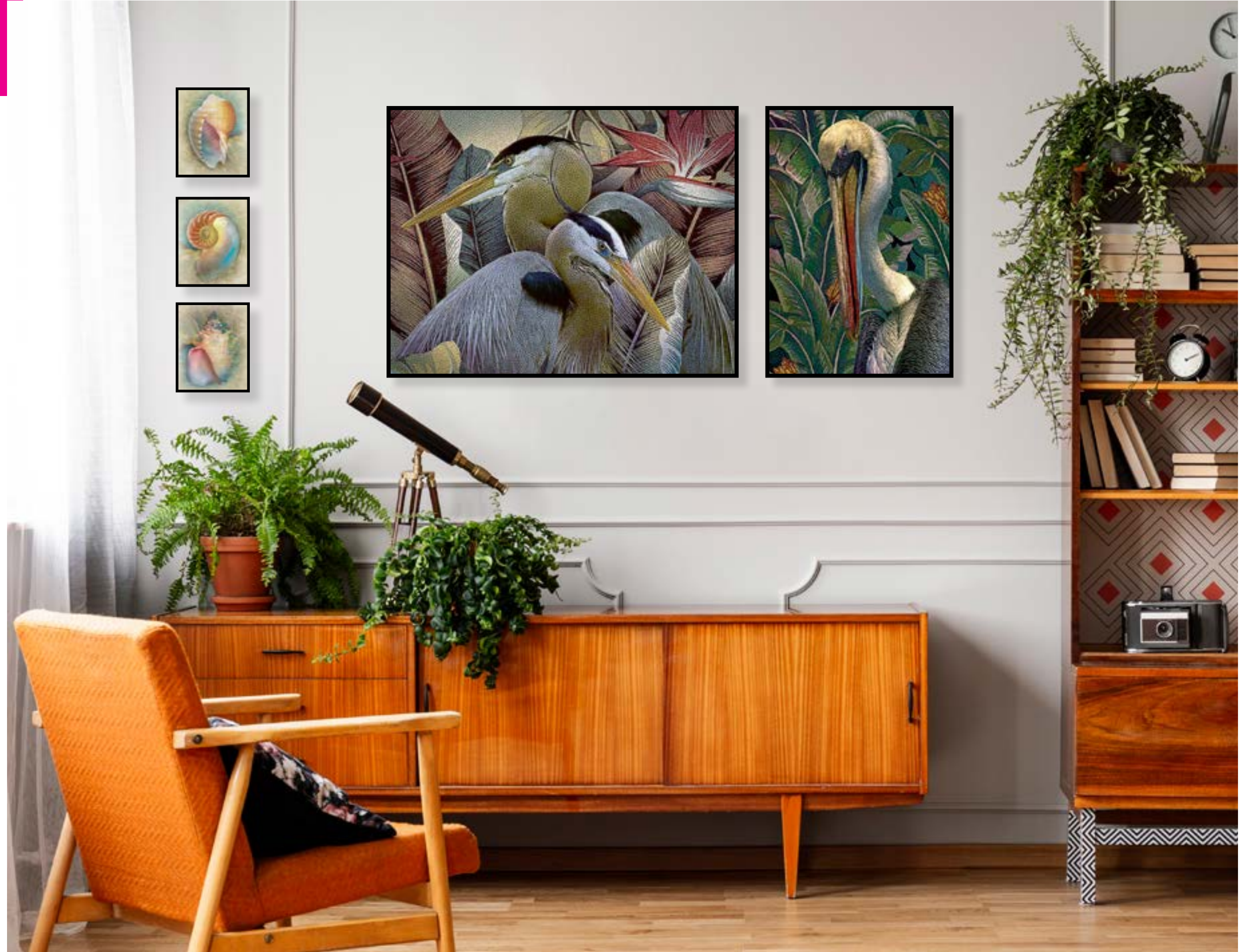
Left group from top to bottom: 135375 Aquatica III , 135374 Aquatica II , 135376 Aquatica IV Center prints from left to right: 119795 Two to Tango , 119796 Primal Pelicana

CLICK HERE TO VIEW ALL IMAGES BY THIS ARTIST